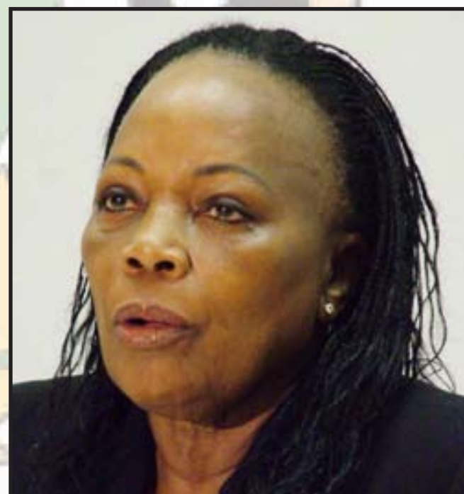
The Honourable Deputy Prime Minister, Libertina Amathila