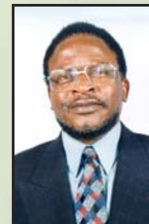
The Minister of Regional and Local Government, Housing and Rural Development, Jerry Ekandjo