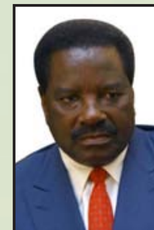
The Minister of Safety and Security, Dr. Nickey Iyambo