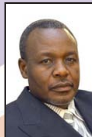
The Minister of Lands and Resettlement, Alpheus INaruseb