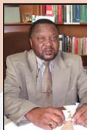
The Minister of Veterans Affairs, Ngarikutuke Tjiriange