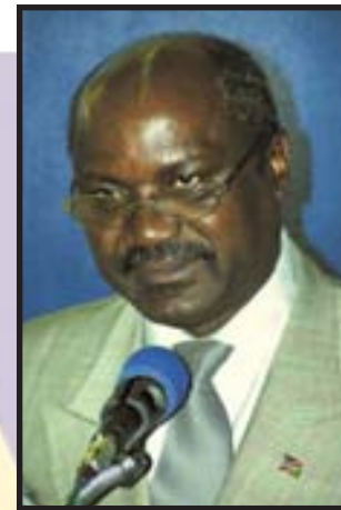
The Minister of Defence, Maj. Gen. (ret) Charles Namoloh