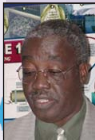
The Minister of Labour and Social Welfare, Immanuel Ngatjizeko