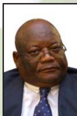
The Minister of Works and Transport, Helmut Angula