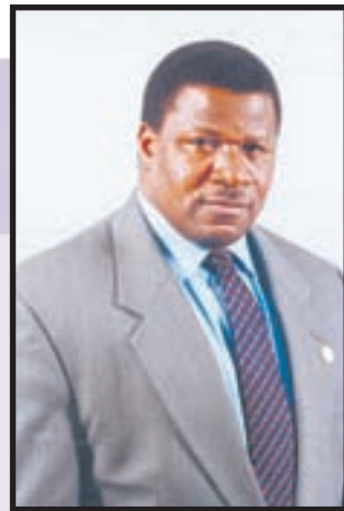
The Minister of Agriculture, Water and Forestry, John Mutorwa