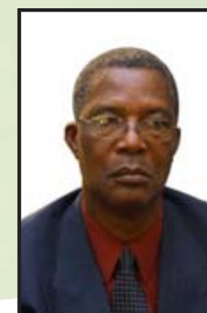
The Minister of Youth, Sport and Culture and National Service, Willem Konjore