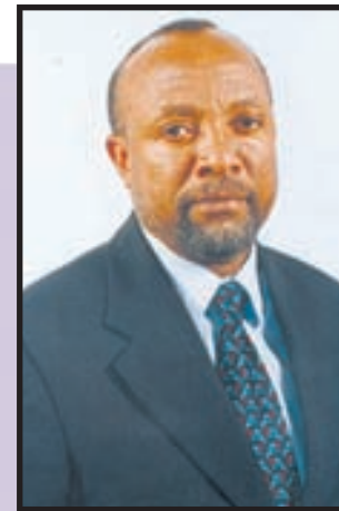
The Minister of Education, Nangolo Mbumba