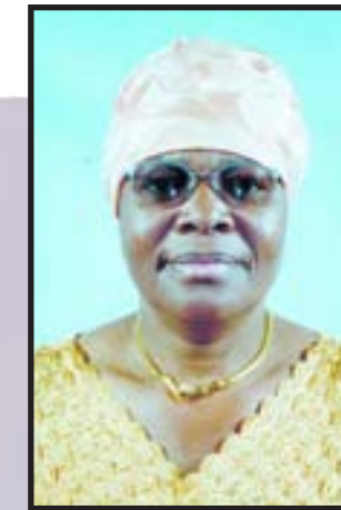
The Minister of Environment and Tourism, Netumbo Nandi-Ndaitwah