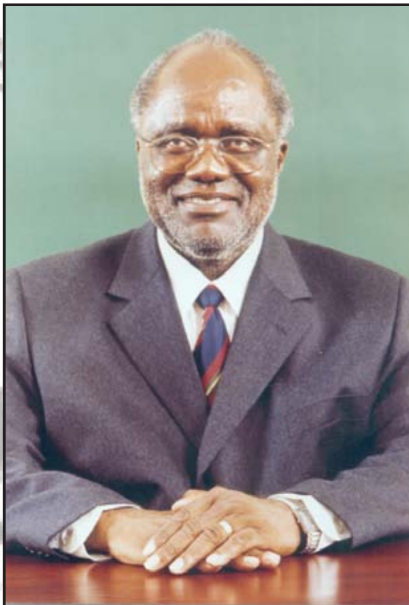
His Excellency President Hifikepunye Pohamba