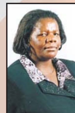
The Minister of Home Affairs and Immigration, Rosalia Nghidinwa