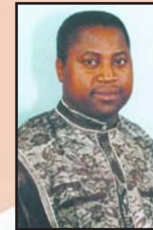
The Minister of Fisheries and Marine Resources, Abraham Iyambo