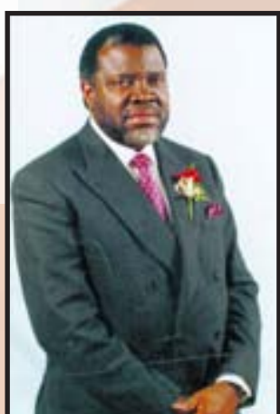
The Minister of Trade and Industry, Dr. Hage Geingob