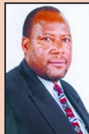
The Minister of Mines and Energy, Erkki Nghimtina