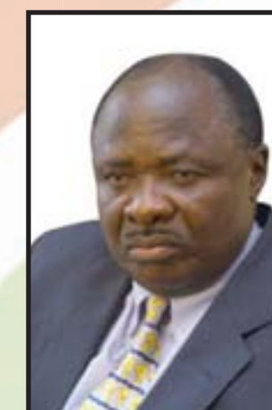
The Minister of Information and Communication Technology, Joel Kaapanda