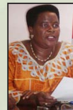
The Minister of Justice and Attorney-General, Pengukeni Iivula-Ithana