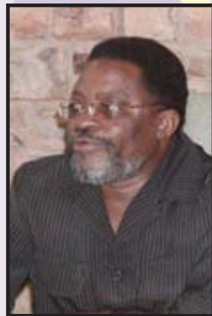
The Minister of Foreign Affairs, Marco Hausiku