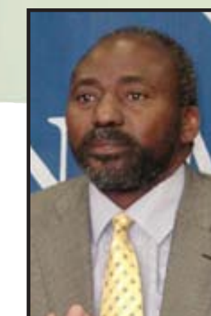
Director General of the National Planning Commission, Prof. Peter Katjavivi