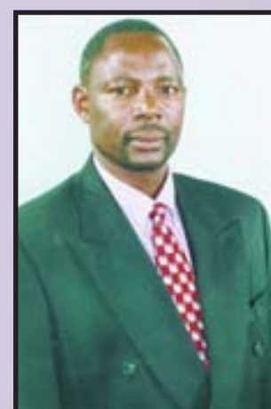
The Minister of Health and Social Services, Dr. Richard Kamwi