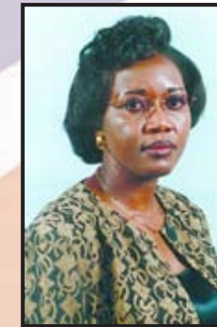
The Minister of Finance, Saara Kuugongelwa-Amadhila