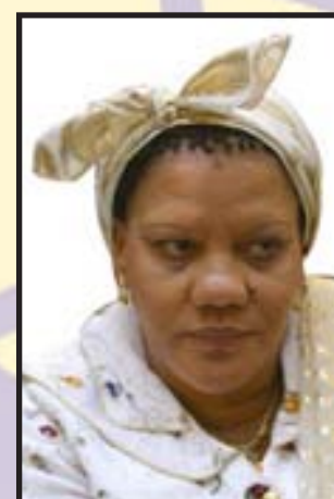
The Minister of Gender Equality and Child Welfare, Marlene Mungunda